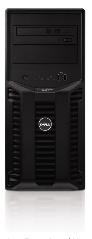
Figure 2. Front-Panel View

Figure 2 shows the front-panel view of the PowerEdge T110 II.